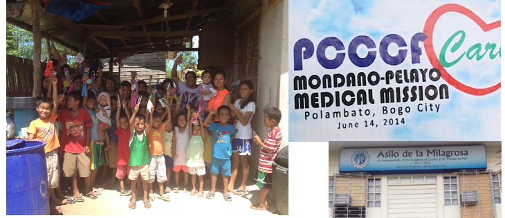
Children and patients were cheering and thanking the PCCCF for funding the Medical Mission

In addition to the $3,500 of the PCCCF donation to Don Bosco for medicines, vaccines, medical supplies and