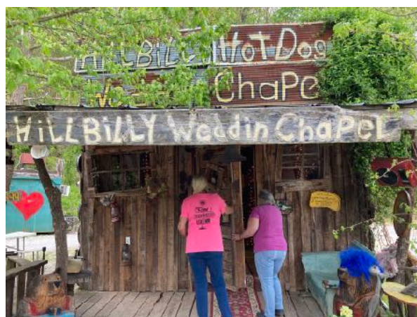
Wedding Chapel at HillBilly's Hot Dogs