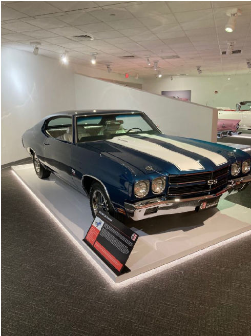
1970 Chevelle SS