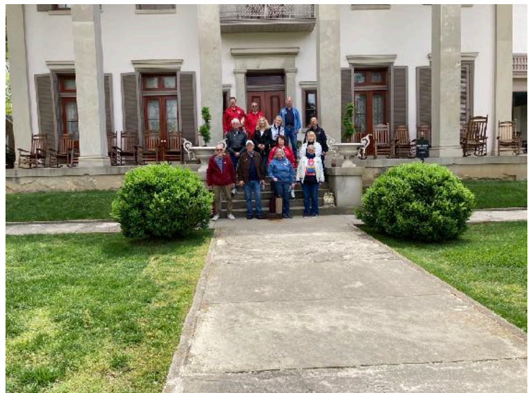
Group Picture at Belle Meade Plantation