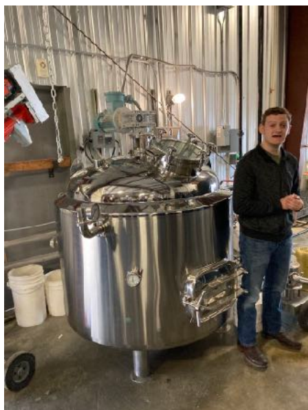
Learning How Bourbon is Made