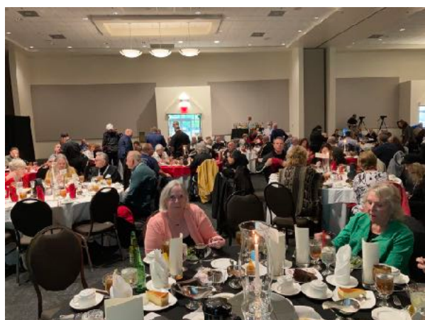
Hall of Fame Dinner