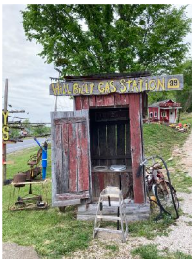
At HillBilly's Hot Dogs