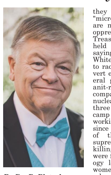
By Dr. R. Pletsch

During the last few weeks I've asked every parent I met what subjects they are worried about in September. The answers were as diverse as our neighborhood. But most answered within four groups: 1. nothing, they don't know enough to comment. 2. Sex ed for all. 3. Worry about transgender taking over girls' high school sports. and 4. critical race theory.