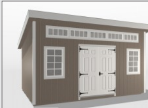
12' Long and smaller - 1 Window 16' Long and larger - 2 Windows