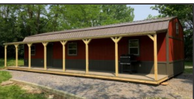
We can quote finished interior