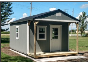
We can quote finished interior