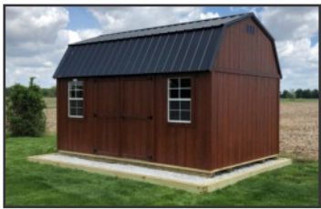
Includes two lofts and two windows