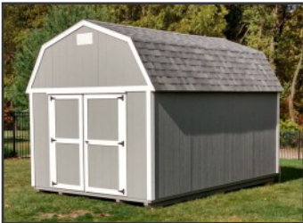
Includes two lofts