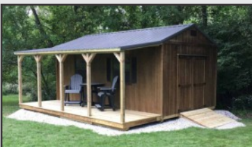
We can quote finished interior