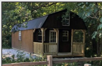
We can quote finished interior