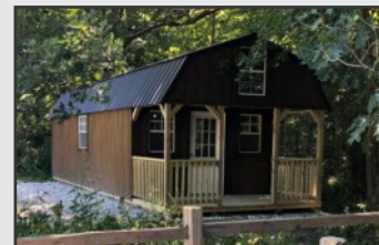
We can quote finished interior