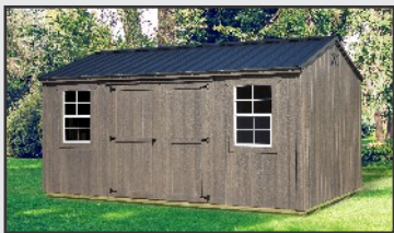
Includes two windows