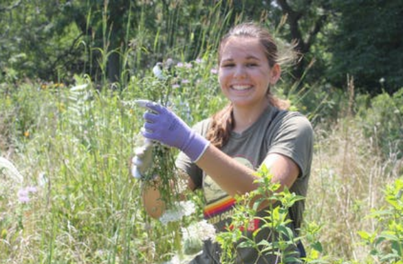
Coastal Habitat Restoration through pulling weeds, planting native species or weed collecting.

Volunteers of all ages are invited to participate in a Shedd Aquarium Action Day to restore and protect nearby beaches, waterways, and forest preserves. You'll support animals from frogs to fish while having fun and learning along the way.