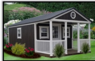
A-Frame Cabin Your choice 4', 6' or 8' porch (loft above) 9-lite door, (4) 24"x27" and (1) octagon window