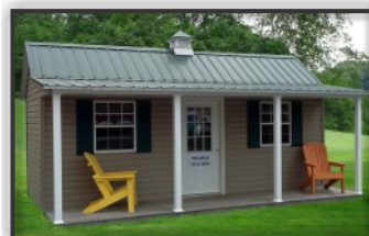
Pool House 12' wide - 3'6" porch / 14' wide - 4' porch 9-lite door, (4) 30"x36" windows, shutters and cupola