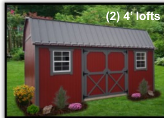
Lofted Garden Shed Buildings up to 14' long - 1 window 16' and longer - 2 windows