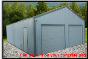
Metal Built on Site Garage (2) 9x7 garage doors, 3' entry door and (1) 30x36" window