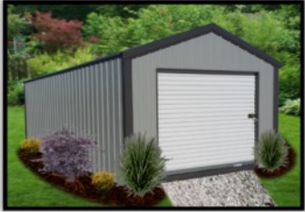
Standard Metal 8' Wide - 5' roll up 10' - 14' Wide - 6' roll up

All buildings in this column available in your choice of vinyl, painted or urethane siding and metal or shingle roof.