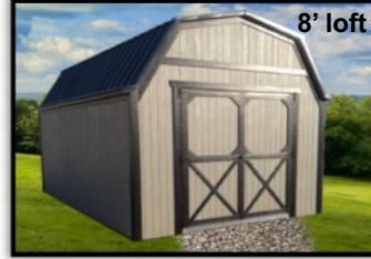
End Loft Your choice double door or 5' roll up door 8' wide - 4' roll up door