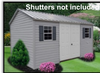
Garden Shed Buildings up to 14' long - 1 window 16' and longer - 2 windows