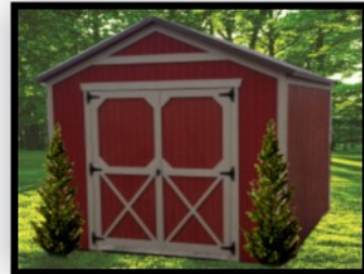
Utility Your choice double door or 6' roll up door 8' wide - 5' roll up door