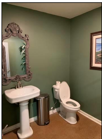
M.S. Shore Company, Inc. 904 N. Church St. Greenville, SC 29601