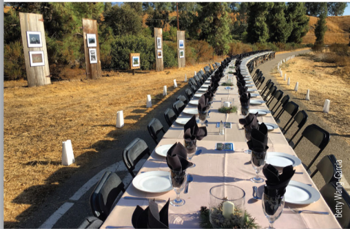
Dinner on the Trail event to celebrate the River Parkway Trust's 30th Anniversary.

the habitat enhancement work we've completed at Fresno River West over the last half dozen years. Guests traversed through the revegetation area for cocktails and then to sites nearer the river for dinner and dessert. Over the course of the evening numerous people commented on the beneficial impact of the Trust's work to improve the land for local wildlife, and the importance of getting more people out to see and experience the great San Joaquin River.