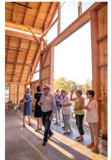
Dinner on the Trail guests get a sneak peak at construction progress for the River Center Barn.