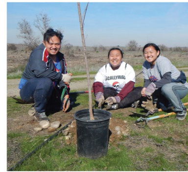
Volunteers help plant native trees at Fresno River West.

The first was the Sunset at Spano River Ranch walking cocktail party. This party introduced about 100 guests to