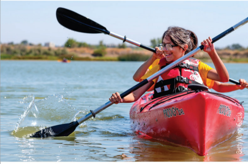
Valley Children's Adaptive Sports Program participants enjoy a paddling clinic at Sycamore Island.

On the first day of fall 2018, I drove in to the River Center to attend a Party for the Parkway celebrating the River Parkway Trust's 30th anniversary. A long table lined the Eaton Trail. There was music, fun, great wine, and many River Parkway Trust supporters who came to enjoy a beautiful evening near the Hidden Homes Pond. There was something special about the celebration that evening. Of course there were the old friends