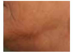
Post 2 treatments