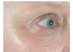
Post 3 treatments