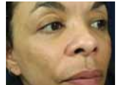
Post 2 treatments