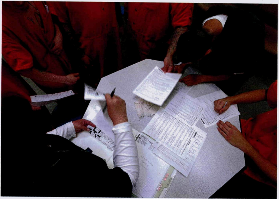
As more soldiers are returning home from Afghanistan and Iraq, more veterans are presenting with a diagnosis of PTSD and a history of TBI.

One of the stronger indicators between PTSD and criminogenic behaviors in incarcerated veterans was the presence of a traumatic brain injury or TBI. As more soldiers are returning home from Afghanistan and Iraq, more veterans are presenting with a diagnosis of PTSD and a history of TBI. According to research, PTSD has been shown to occur more commonly in veterans with combat-related concussions (mild TBIs) than in those with other injuries. Three-quarters of Overseas Contingency Operations patients with a TBI diagnosis also had a diagnosis of PTSD. One-fifth of OCO patients with a PTSD diagnosis also had a diagnosis of TBI. When a veteran suffers from a combination of TBI and PTSD, his or her added symptomology often includes irritability, cognitive defects, insomnia, depres-