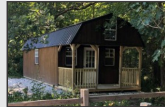
We can quote finished interior