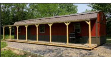
We can quote finished interior