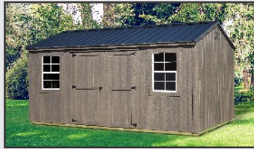
Includes two windows