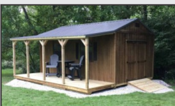
We can quote finished interior