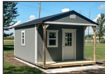
We can quote finished interior