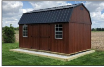
Includes two lofts and two windows