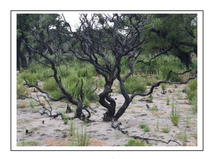
Burned A. purissima after the Rucker Fire.

So, while fires keep burning down much of developed California, areas dominated by chaparral will recover quickly because of their long history with fire. Ceanothus will be more prominent in younger stands than older stands as Arctostaphylos tops them. Next time you have the opportunity to visit a post-fire area, look to see if both genera are present.