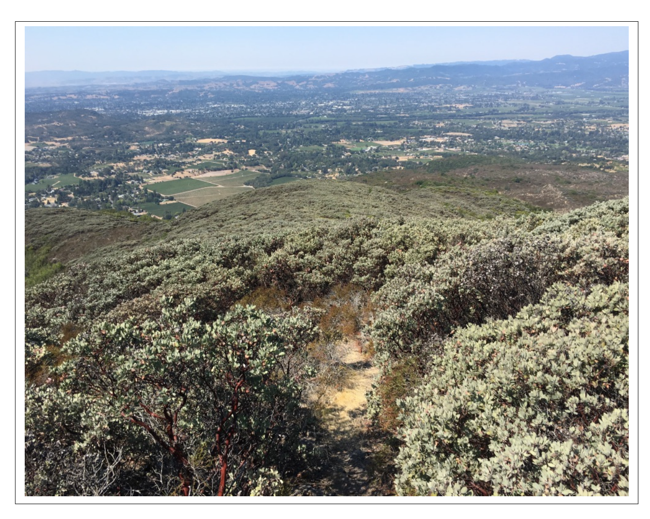
Mt. George prior to the 2017 Atlas Fire. Area dominated by an old-growth stand (56-years-old) of Arctostaphylos . Napa Valley in the background.

The Atlas Fire cleared off the above-ground plants, killing the adults of A. canescens , A. stanfordiana , and any remaining C. purpureus . The fire also stimulated the seed bank of all these species. In the first spring after the fire, lots of seedlings could be seen. By the second year it was clear that, even in the areas with high-intensity fire, the shrubs would soon dominate the site again (see photo on the next page). The only difference is that the Ceanothus is going to be a prominent member of the chaparral for decades, before it slowly declines again, hiding once more in the soil seed bank until the next fire.