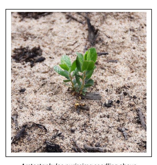
Arctostaphylos purissima seedling above, Ceanothus cuneatus var. fascicularis seedling below.

Arctostaphylos and Ceanothus tend to grow together and they are the most diverse genera in terms of number of species in Western North America.