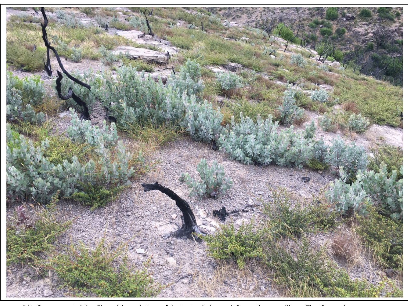
Mt. George post Atlas Fire with a mixture of Arctostaphylos and Ceanothus seedlings. The Ceanothus purpureus (light green) will grow quickly, but has a shorter life span when compared to the Arctostaphylos canescens (blue green) and Arctostaphylos stanfordiana (bright green, a few at mid-left side margin). Eventually, the Ceanothus will disappear, preserving its presence in the soil seed bank, and Arctostaphylos with dominate again.

After the 2017 Rucker Fire near Lompoc, California, seedlings of Arctostaphylos purissima and A. rudis arose from the seed bank, but so did seedlings of Ceanothus cuneatus var. fascicularis. Similarly, after the 2018 Camp Fire, Arctostaphylos mewukka subsp. truei seedlings are intermixed with Ceanothus cuneatus seedlings.