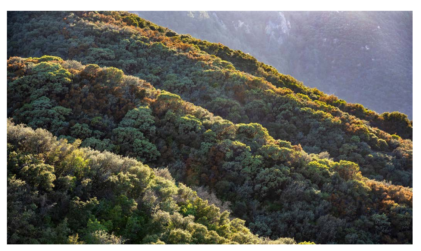
Old-growth chaparral at evening light. Santa Barbara County, CA.