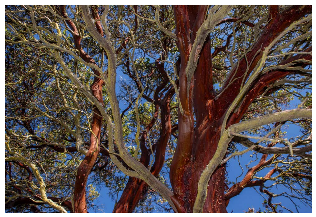
The old-growth canopy of manzanita chaparral at Burton Mesa, CA.

Once home to the now extinct California grizzly bear, old-growth chaparral is known for beautiful manzanitas with waist-sized trunks, colorful lichens, and an elfin understory carpeted with a soft layer of fallen leaves and twigs. Defined as being 50-years-old or more, old-growth chaparral provides habitat for an amazing array of life forms — one of the reasons California is so rich in biodiversity.