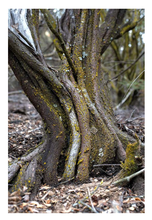
The storied, fissured trunk of an old-growth Ceanothus, Santa Barbara County.

While pyrogenic habitat forms quickly after fire in chaparral, it is somewhat short-lived – the natural successional shift to more mature chaparral is inevitable. Aging chaparral continues to experience subtle changes important for floral and faunal diversity and continues to sequester carbon. Shrubs die for various reasons, either individually or en masse during chronic or acute droughts, while others continue to recruit despite the lack of fire (i.e., obligate resprouters). Wildlife alter understory structures, especially rodents (e.g., Neotoma