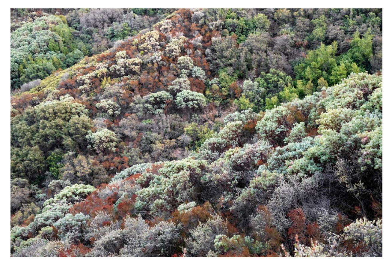
Old-growth chaparral in the Santa Ynez Mountains, Santa Barbara County, CA.