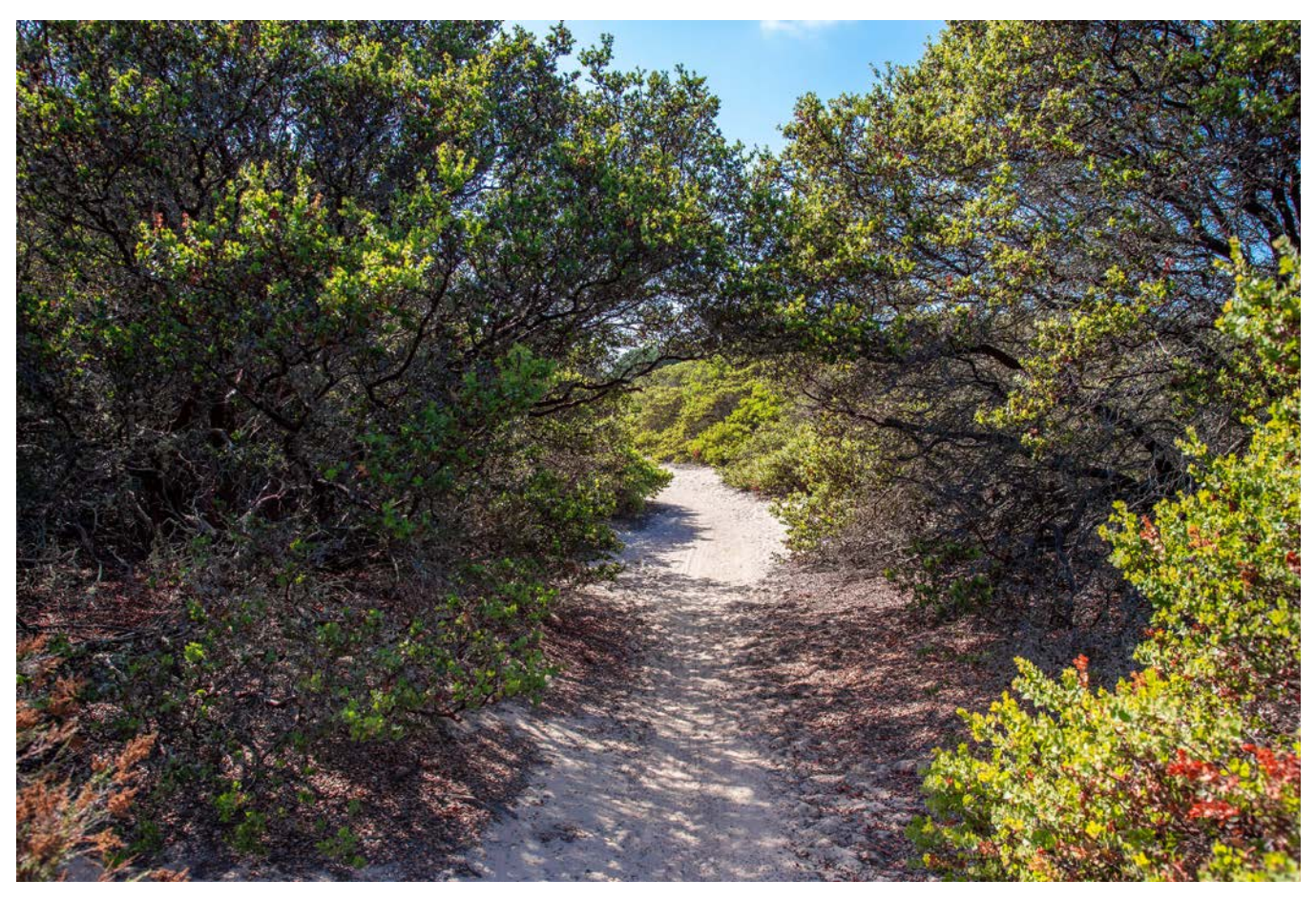
The sandy path through the old-growth manzanita chaparral on Burton Mesa, CA.

ecosystem in this older state, the general public is largely unaware of its existence or perceive it negatively.