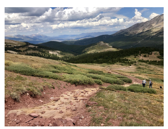
2018 North Tarryall Creek Monitoring Work Day.

Join us as we revisit our 2018 restoration project site at the headwaters of the North Tarryall Creek in South Park, just west of Boreas Pass Road. We will monitor for revegetation of the project site and illegal motorized use.