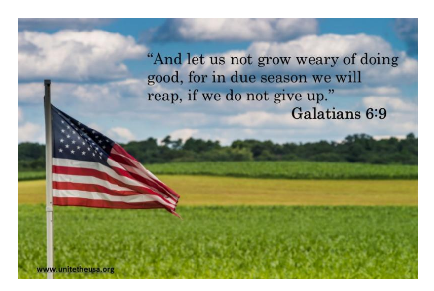
"And let us not grow weary of doing good, for in due season we will reap, if we do not give up." -Galatians 6:9