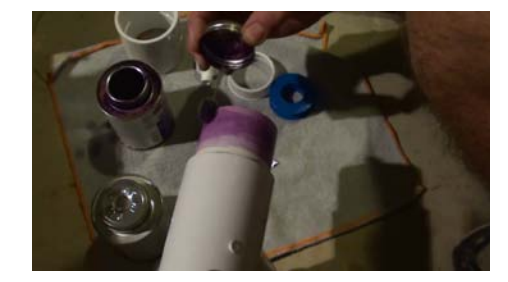
Figure 7. Thread sealant or pipe glue will help ensure fittings remain connected and leak-free.