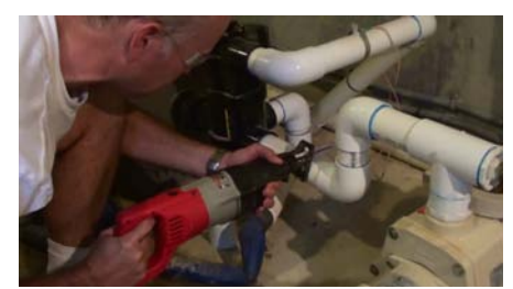
Figure 6. A reciprocating saw often works well to cut PVC pipe during the installation process.

• Electrical meter: preferably True RMS clamp-on kW and multi-function style meter.