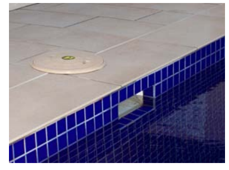
Figure 9. The skimmer is the port that draws water from the pool and into the filtration system.

Filters only capture what is suspended in the water passing through them, and only what is large enough to collect on the filter media. Once debris and sediment enters the water, one of three things will happen: it will float, sink, or get suspended in the water. Floating matter can be skimmed off the surface to be collected and removed, but once it sinks to the floor, it will stay there without some kind of help to remove it. Variable speed pumps need to run longer to accomplish the required turnover due to their lower flow rates. As a result, the pool spends much more time skimming the water and preventing debris from sinking. The result is a cleaner pool with improved water clarity and is another benefit