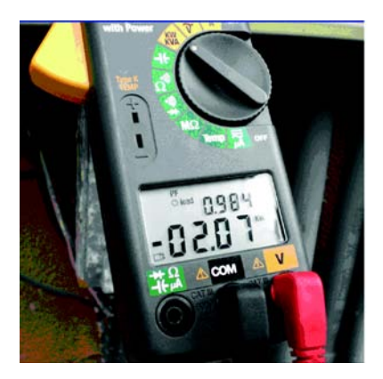
Figure 4. The RMS kilowatt meter can quickly and easily determine the pool pump's electrical consumption rate.