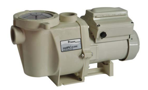
Figure 1. A variable speed pool pump can obtain similar gpm rates as a single-speed pump but at greater energy efficiencies.

When comparing performance issues between single-speed and variable speed pumps, there are no negative performance issues associated with the variable speed pump. When properly calibrated, the variable speed pump can increase flow rates to be equal to or greater than the existing single-speed pump. However, the performance advantages of a variable speed pump go beyond energy savings. Variable speed pumps are noticeably quieter, require less maintenance, last longer, and, through slower water filtration rates, allow for better and more effective filtration of the pool water. The slower circulation rates also put less strain on the filters, plumbing, and other parts of the system, which reduces the chance of leaks, repairs, or premature plumbing component replacement.