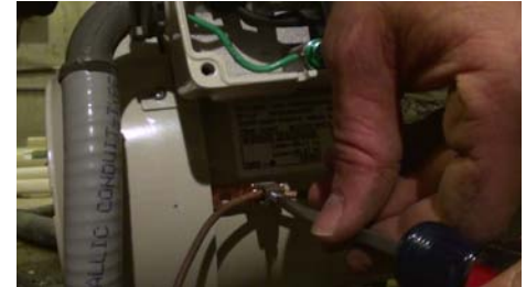
Figure 8. Make sure the ground bonding wire is securely fastened to the pump's bonding lug.

Most existing single-speed pumps are electrically powered through a timer or automation system to schedule their daily operation. Newer variable speed pumps have the time clock and scheduling feature inherent in their control system. For these pumps, it is preferable to wire them directly, bypassing the existing time clock. For installations with remotely operated automaton systems, the pump may be powered through relays. This is done to ensure that the pump has a continuous uninterrupted power supply.