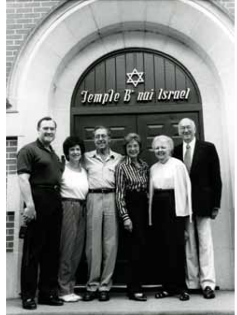
Members and friends celebrate Temple B'nai Israel's 50<sup>th</sup> anniversary, June 1998.

Participation in Sabbath services dwindled in the 1970s and '80s. Perhaps to attract more members, B'nai Israel joined the Reform movement, a move that appears to have led to a return to regular Sabbath services. Temple B'nai Israel's ofaffiliation ficial with the Reform movement, however, was brief. The congregation did not maintain its relationship with the national