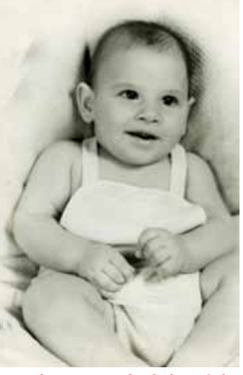
oldest child, Anderson, SC, 1945. family, 1950.