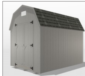
One paint color only Trim will be same color as body