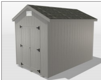
One paint color only Trim will be same color as body