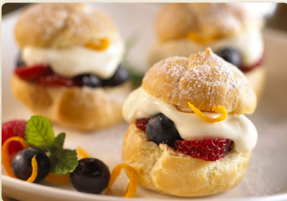
Cream puff pastries with sweetened Mascarpone cream and fresh fruit

In 1990, BelGioioso became the first American company to manufacture this fresh Italian cheese in the United States. We now offer three types of Mascarpone for various applications. Our classic version is a naturally sweet, yet surprisingly light cheese ( \frac{1}{2} the calories of butter) produced from only the freshest cream. Its soft, creamy texture spreads with ease and blends well with other ingredients. Tiramisù Mascarpone is our flavored version, already mixed with real coffee and sugar. Crema di Mascarpone™ is a BelGioioso original, produced for those who prefer a whipped textured body to their Mascarpone.