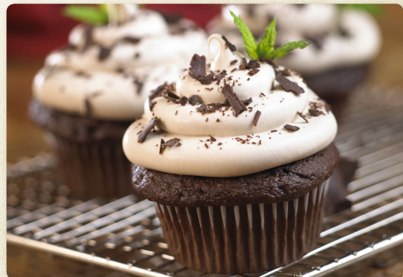
Chocolate cupcake with Mascarpone frosting