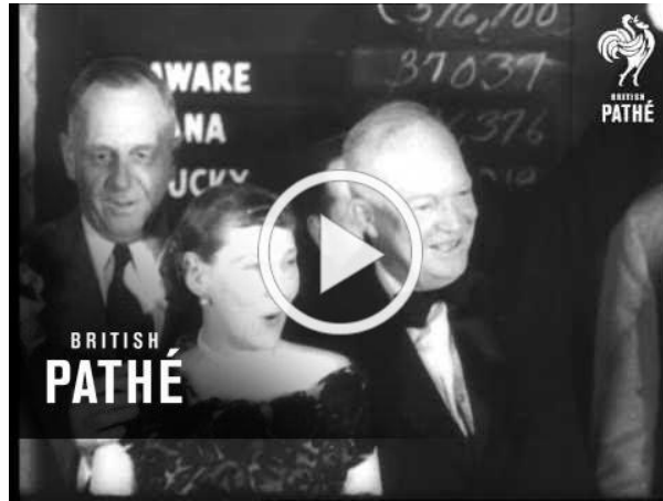
President Eisenhower Wins (1952)

This month's historical video features footage from the 1952 election when President Dwight Eisenhower won the presidential election.