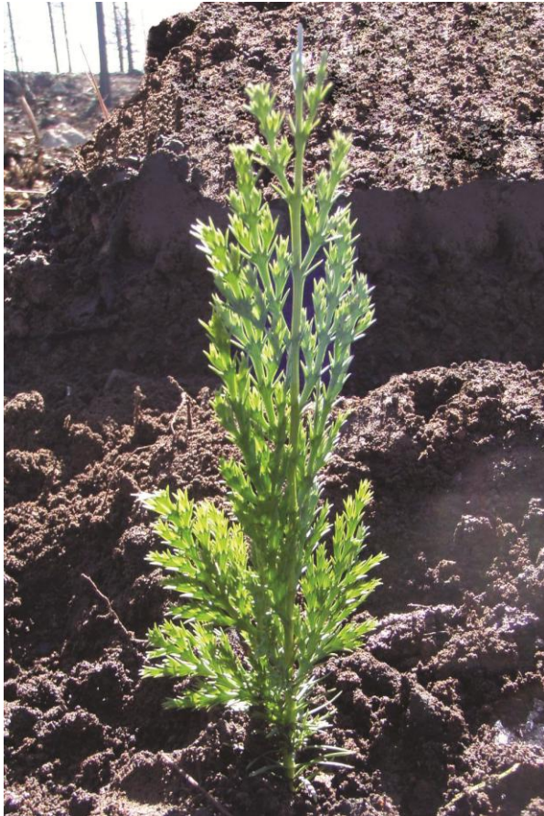
Seedling planted after a wildfire, Lassen National Forest.

Dense middle-aged forests are also more susceptible to drought stress, large-scale insect outbreaks and disease epidemics.