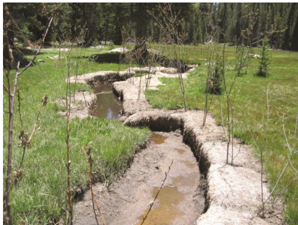
Loggy Meadow Restoration Project on the Sequoia National Forest. The project stabilized stream banks and allowed the stream to access its flood plain, returning the area to a more natural condition.