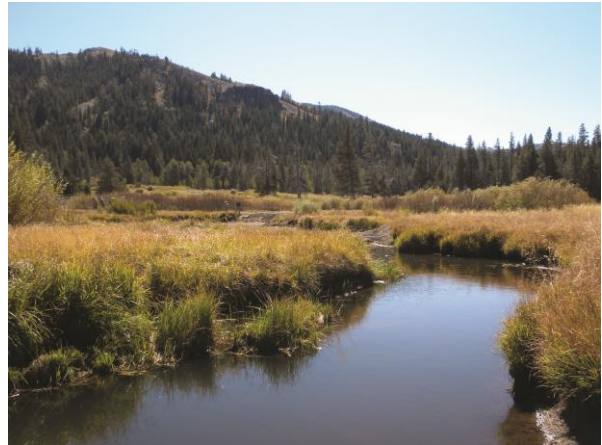
Meadow restoration in the Tahoe National Forest

Ecosystem services are the goods and services that flow from wildlands and forests that are valued and used by people, and that directly or indirectly support human well-being. Wildlands and forests are valued for basic goods, such as wood, fiber, and water, but these ecosystems also deliver important services that are perceived to be free or limitless such as air and water purification, flood and climate regulation, biodiversity, scenic landscapes, wildlife habitat, and carbon sequestration and storage. The National Forests are important providers of ecosystem services to humans and to other inhabitants of our wildlands as well. Our commitment to restoration-based management includes a commitment to a renewed focus on the sustainable delivery of ecosystem services.