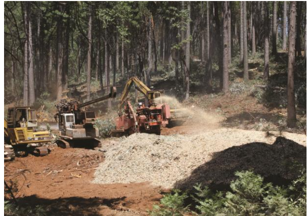
A wood chipper processes woody biomass from a restoration thinning project, Mt. Hope Stewardship Project Plumas National Forest.

As we work toward the goals outlined above, we will learn and adjust as we go. Over time there will be new science, new ideas, and new collaborations that will improve our understanding. With this new understanding, we will make course corrections in policy and practice and move even more efficiently toward our overall goal of resilient forests and wildlands.