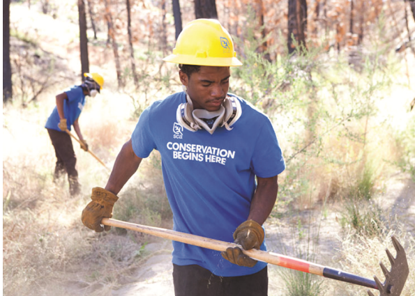
The Student Conservation Association (SCA) is one of the many partners that help restore California's National Forests. On the Angeles National Forest, SCA students restore a trail as part of a partnership called the "Angeles Wildfire Recovery Project."

As we work toward the goals outlined above, we will learn and adjust as we go. Over time there will be new science, new ideas, and new collaborations that will improve our understanding. With this new understanding, we will make course corrections in policy and practice and move even more efficiently toward our overall goal of resilient forests and wildlands.