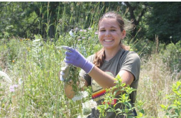
Coastal Habitat Restoration through pulling weeds, planting native species or weed collecting.

Volunteers of all ages are invited to participate in a Shedd Aquarium Action Day to restore and protect nearby beaches, waterways, and forest preserves. You'll support animals from frogs to fish while having fun and learning along the way.