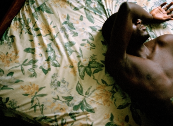
Photo by Mimi Cherono Ng'ok. Untitled, 2014. © Mimi Cherono Ng'ok.

The Art Institute of Chicago, 111 S. Michigan ave. is presenting Mimi Cherono Ng'ok: Closer to the Earth, Closer to My Own Body on view through February 7th, 2022 . The exhibit features photographs and a film made across Africa, the Caribbean, and South America with the rich and diverse botanical cultures of the tropics.