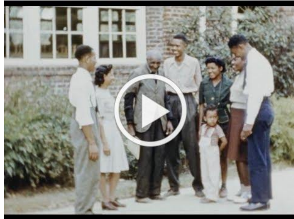
George Washington Carver (1937)