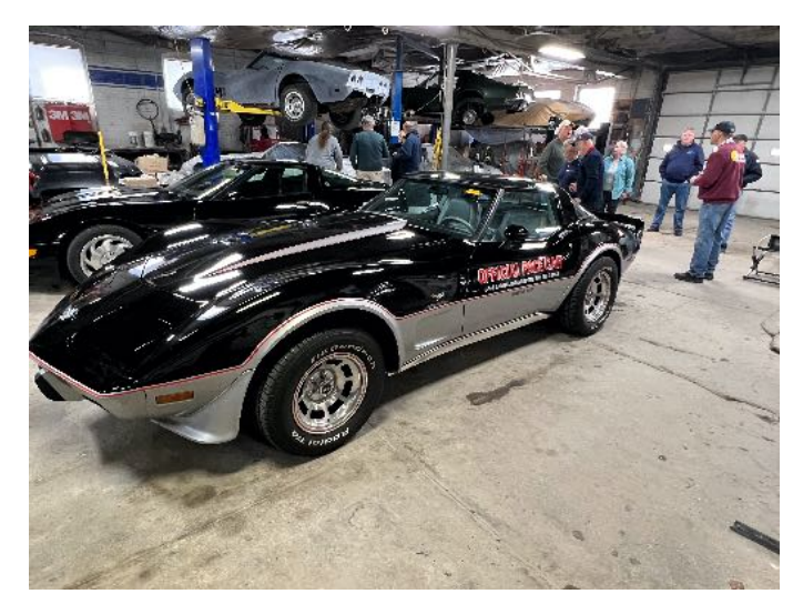
A Great Time Was Had By All!