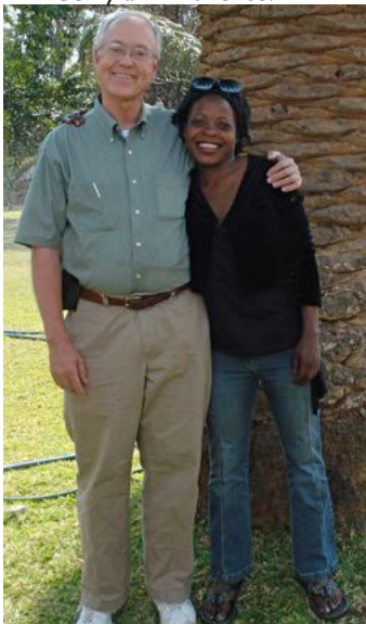
Wild Zambia poinsettia.