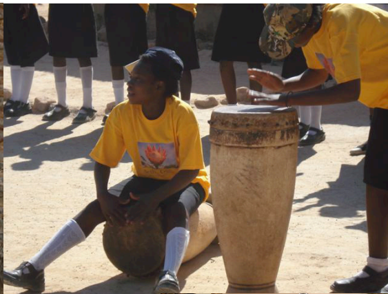
Little drummer girls.