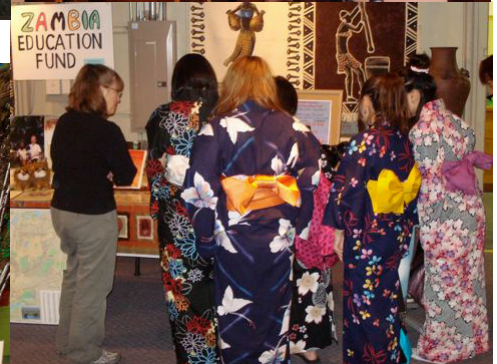
TIUA girls in kimonos at Zambia Night.

You can help give Beth's Girls the gift of education this holiday season. Invite friends to be EBZEF supporters.