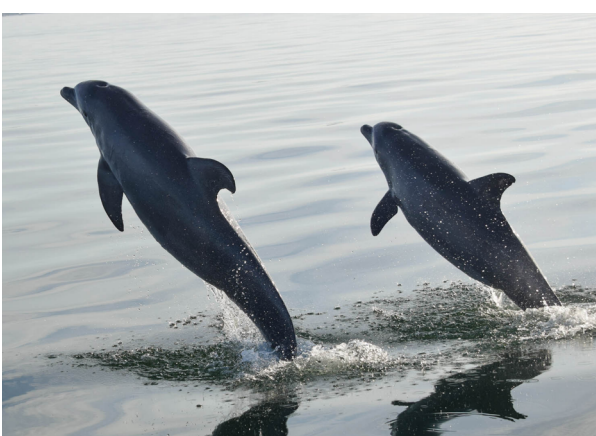
Photo credit: Chicago Zoological Society/Sarasota Dolphin Research Program—photos taken under NMFS Scientific Research Permit No. 20455

Local dolphins leaping in Sarasota Bay, Florida.