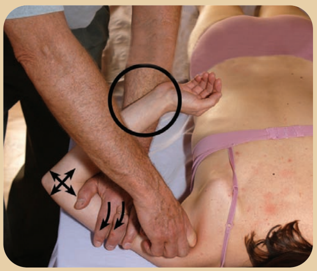
Figure 15 — Active stretching. Raise client's wrist with your left forearm to move humerus into internal rotation.

Although broad superficial strokes with the forearm or fist may be necessary to prepare the area for more detailed work, using the fingers or knuckles will offer the most effective treatment for specific areas of tightness in the muscles or the insertion of tendons on the humerus. Work extremely slowly, and wait for the melt of tissue using strokes that move in the direction of lengthening, but you may also soften fibrous tendons by rolling them between your fingers.