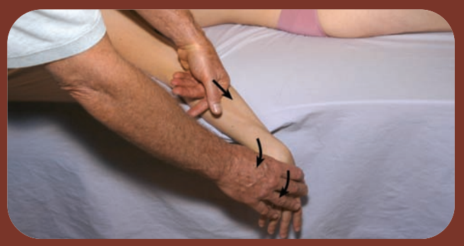
Figure I — Working the extensor compartment of the forearm.

These principles are useful on virtually any muscle group in the body, and your clients will immediately notice the clarity of intention and effectiveness of the work. Remember, this work does not need to be intense or create discomfort for your clients. Even if you are giving a nurturing relaxation massage, the precision of your strokes will be appreciated and make your work more fun. Let's begin by demonstrating these principles with a fairly simple example: the arms.