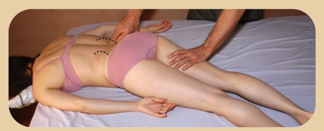
Figure 4 — Prone quadratus work.

By positioning the top leg slightly posterior and reaching inferior (it may be necessary to support the knee with a pillow), the right ilium is pulled down to stretch the quadratus. At the same time, the arm is abducted above the head to pull the rib cage up. The left leg is flexed at the hip with the knee bent to provide rotational stability in the pelvis and spine. Notice how much more length is afforded in this position than in a normal, knees-bent side-lying position. Work proximal and distal attachments and the belly of the quadratus. Although a soft fist, as shown in Figure 3, is useful to stretch superficial tissue, the muscle belly of the quadratus lumborum requires precise work. Using a scooping motion with the fingers will offer the most comfortable and effective release as you engage deeper tissue.