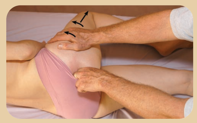
Figure 21 — Side-lying position.

the short rotator muscles and stretching them rather than just sliding over the muscles.