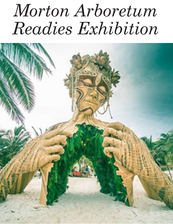
The towering installation, Ven a la Luz (Come into Light), was installed in Tulum, Mexico in 2018.

The Morton Arboretum's next outdoor art exhibition, Human+Nature will connect people and trees. Some exhibition materials remain in transit due to pandemic-related. New exhibition opening date will be decided soon. Renowned artist Daniel Popper created five 15- to 26-foot-tall sculptures that will be featured in various locations across its 1,700 acres, leading guests to areas they may not have explored before. On the East Side, a short walk from the Visitor Center, guests will be able to step within a huge female figure, as if into the heart of nature. Continuing along a less than mile-long walk, they will encounter a majestic maternal figure as tall as a tree, and a sculpture of diverse human facial traits interwoven with root structures. On the West Side, two hands joined by intertwining roots will extend near