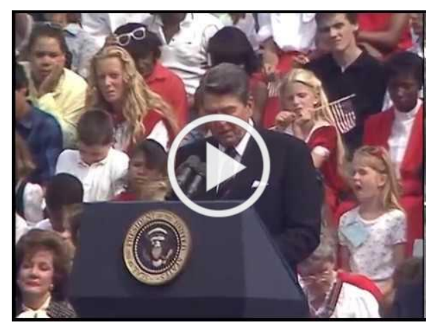
President Reagan's Remarks at the Bicentennial Celebration of the U.S. Constitution