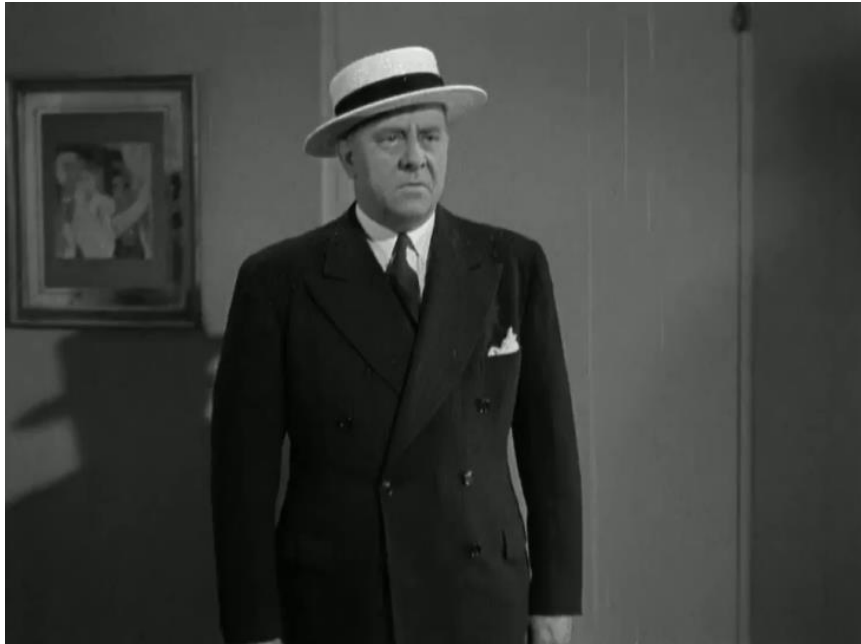
(The wealthy financier Claude Mazzard is another character who wears a straw hat)