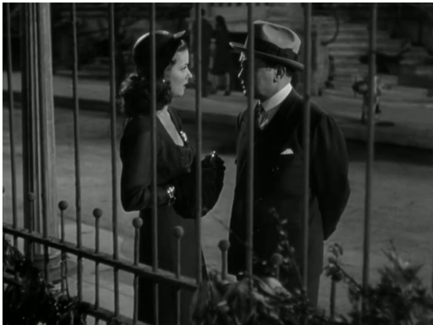
(Reed and Wanley meet and conspire to get rid of the blackmailer. Characters are often seen behind bars in Lang's films)