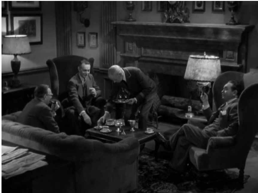
(The three friends lounging at the club. The woman is in the window, the film's spotlight is on men's infatuations and fears)