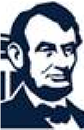
President A. Lincoln

Submissions must be 11 inches by 14 inches and two dimensional. They cannot feature copyrighted characters or images. More details are available at bit.ly/ALPLMArtContest .