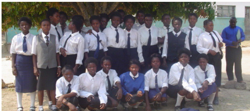
Lumwana West Basic School 2006