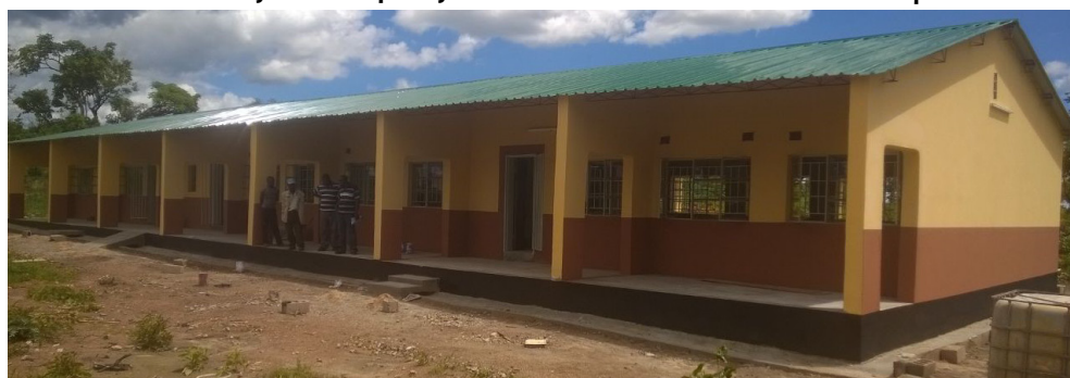
Three-classroom building complete