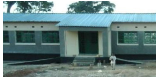
Pre-school with disability ramps

The final two classrooms for Lumwana West pre-school will be ready for term II in May 2017. This highly popular program, initiated by EBZEF in 2011, is a model for pre-schools in Zambia, especially in remote rural villages. Baal Dan Charities helped finance construction. ☞