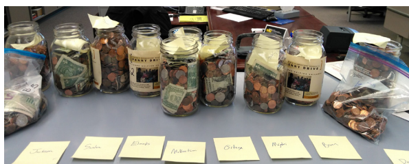
Big work by little hands at Schirle School Penny Drive!