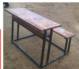
Double desk for Juniors (grades 7, 8, 9)