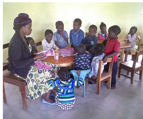
Lumwana West pre-school