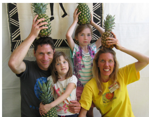
The Wanak Family at World Beat

Volunteers Needed! Help host the EBZEF Booth in the African Village at the 20th Anniversary of the World Beat Festival on June 24th-25th at Riverfront Park in Salem. Stop by the booth to check in on the latest progress of EBZEF's programs in NW Zambia. Contact <ebzefund@gmail.com> to volunteer. ☞