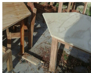
Mukwa tables & chairs construction for new pre-school classrooms