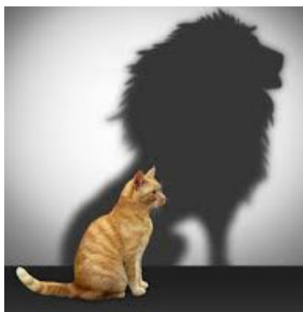
Blake Bowers (2001–2017)