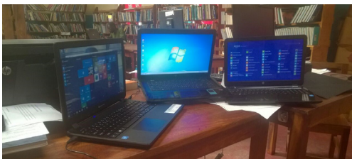
New laptops for Library