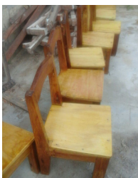
Mukwa chairs for pre-school