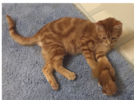
Keats Kitten following in Blake's pawprints