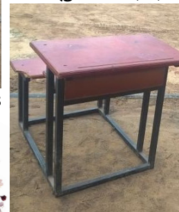
Single desk for Seniors (grades 10, 11, 12)