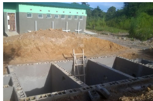
Girls' ablution block & septic tanks