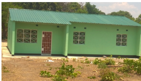
Staff house ready for occupancy