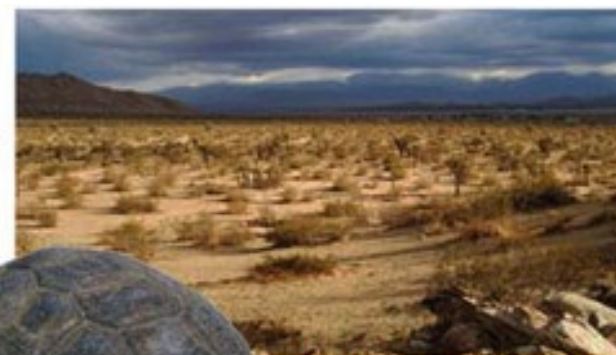
Mojave desert rain clouds

Daytime visitors may see foxes, rabbits and desert tortoises—a burrowing reptile and threatened species. Beware of desert rattlesnakes searching for rodents in the evenings. Among rattlesnakes, Mojave "green" rattlers have the most toxic venom while Mojave sidewinders have the least toxic venom.