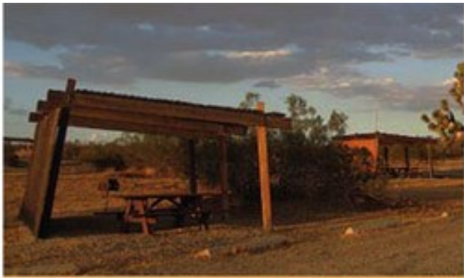
Campsites at sunset

the peak and enjoy a 360-degree view over Antelope Valley and the Mojave desert.