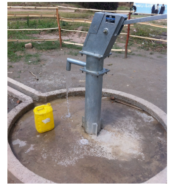
New village well and handpump