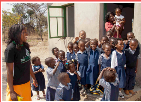
Pre-schoolers leave class for the day