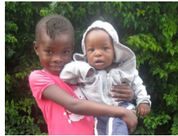
Caring for little brother