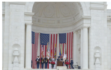
Arlington National Cemetery Memorial Amphitheater

the over 200,000 Volunteers who have served all over the world and the impact in those foreign places as well as in the U.S. and in their own lives.