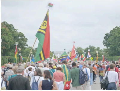
Parade of flags