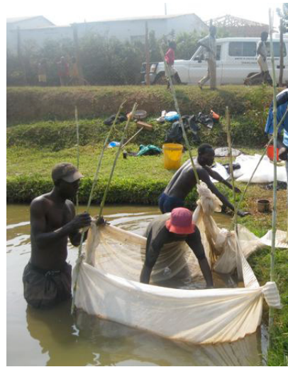
Fish farmers harvesting crop