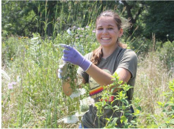
Coastal Habitat Restoration through pulling weeds, planting native species or weed collecting.