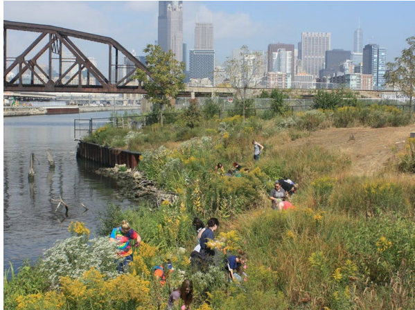
Volunteers working to restore waterways.

Volunteers of all ages are invited to participate in a Shedd Aquarium Action Day to restore and protect nearby beaches, waterways, and forest preserves. You'll support animals from frogs to fish while having fun and learning along the way.