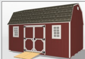
12' Long and smaller - 1 Window 16' Long and larger - 2 Windows