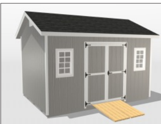
12' Long and smaller - 1 Window 16' Long and larger - 2 Windows